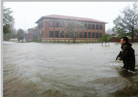
Two national assets, NASA Langley Research Center and Langley Air Force Base in Hampton, VA, saw a 7 to 7 1/2 foot storm surge when Tropical Storm Isabel impacted the Hampton Roads area. Improved flooding predictions that will be assisted by the technology demonstrated by CLARREO Pathfinder are crucial as coastal areas face the threat of increased flooding in the coming decades.